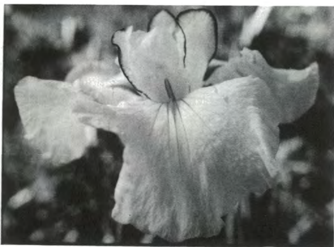
EDGED DELIGHT (Ackerman 94) $35.00