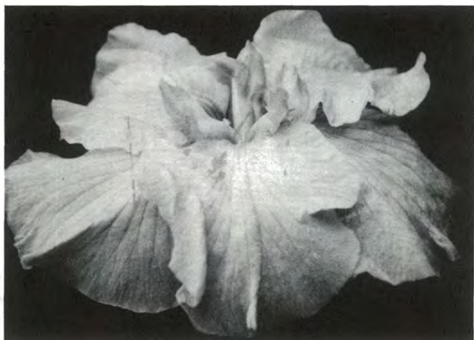
ACK-SCENT PINK (Ackerman 94) $35.00